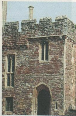
Berkeley Castle is a favourite choice